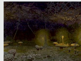
Vana'diel Live Cam, 250kbps (WMP)